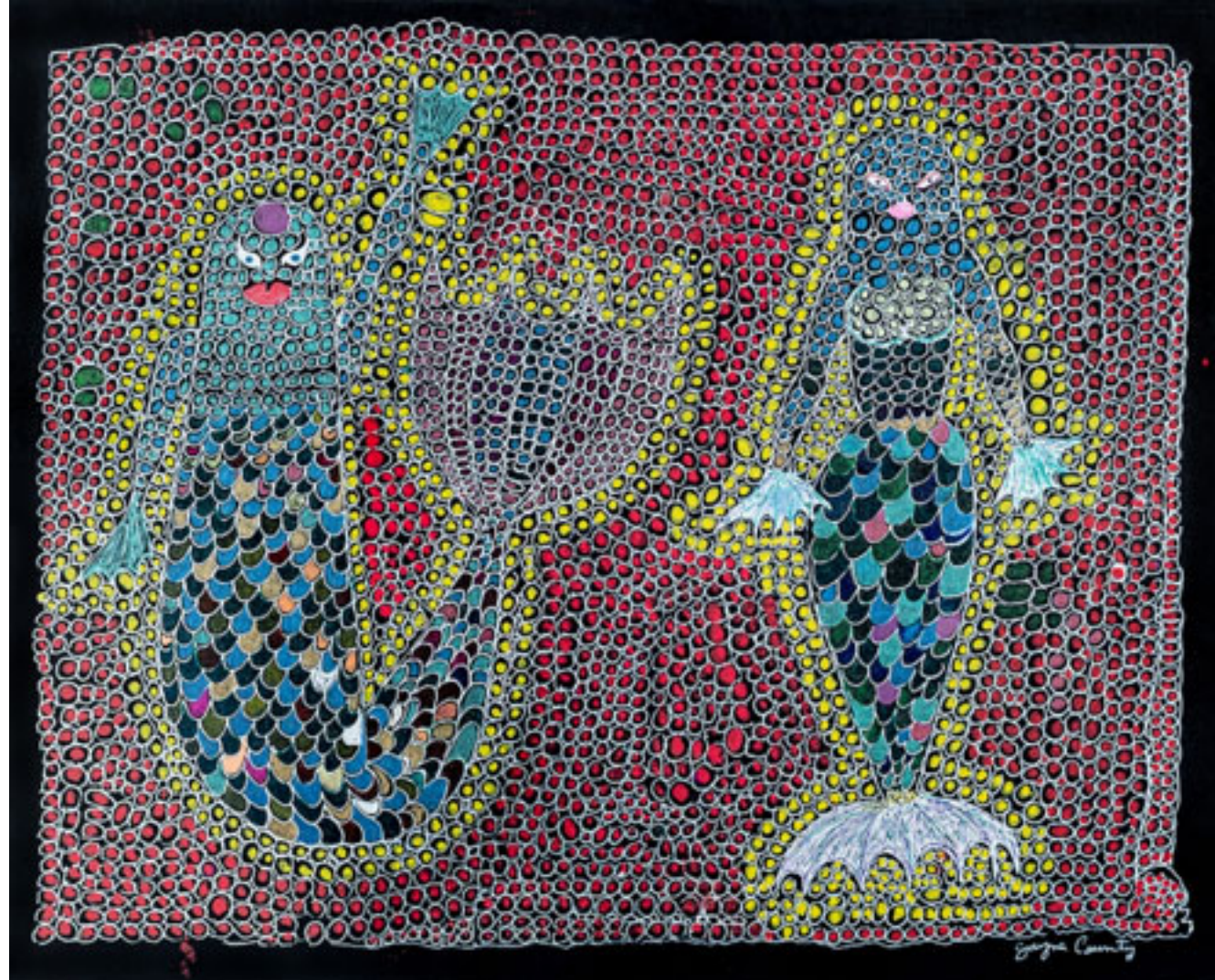
Jayne County, "Untitled" (2017), acrylic and marker on canvas

As punk rock's first openly transgender performer, Jayne County was an inspiration for everyone from Andy Warhol to David Bowie, but never quite got credit for her widespread influence.